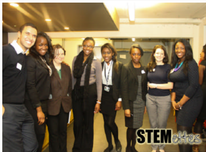
— Students from the Petchey Academy London were amongst the first to arrive.

On Tuesday 12th February, at 7.05pm we began the official launch of the Stemettes. The room was packed with girls, students and women & men from across the STEM industry, eager to hear about the Stemettes, eat pancakes and get stuck in with the evening activities.